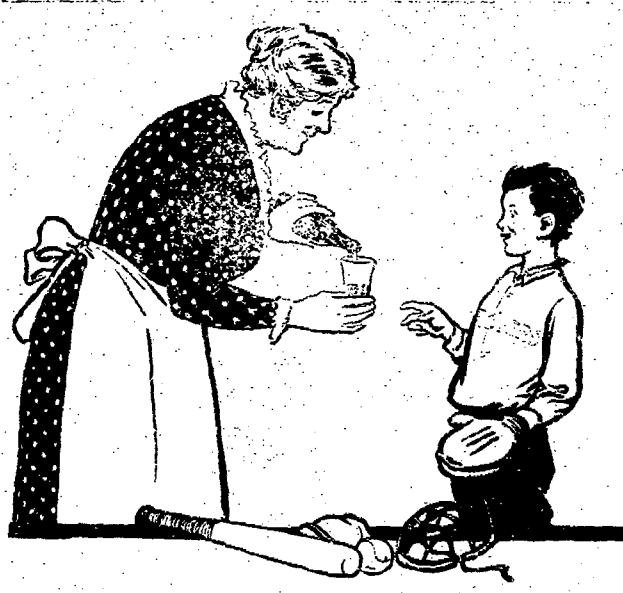
"Ah! That's what I'm looking for, Grandma''

Four Other Valuable Prizes ASK RAUHUT How to