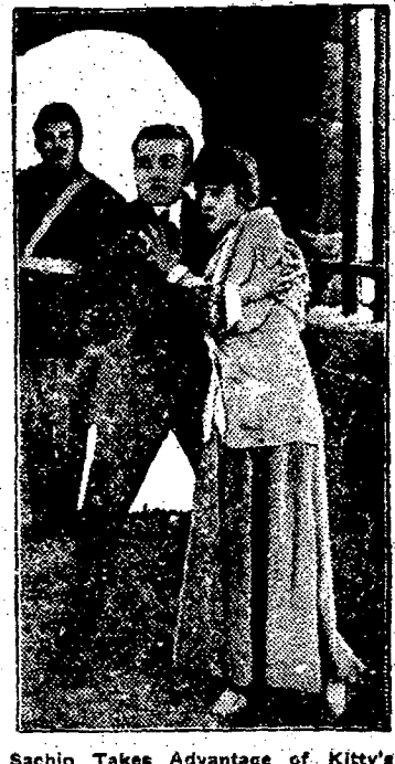
Helplessness, But is interrupted By a Guard.

She entered softly, leaving Rolesi as usual somewhat remote, to guard against any audden intrusion. Once more she east about a searching gaze upon the details of the place. All its