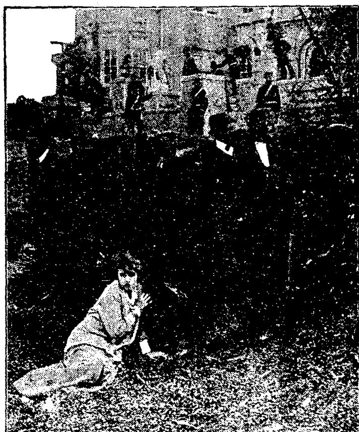
Kitty Escapes From the Palace.

The two giant grenadiers to whom had been assigned the duty of watch-