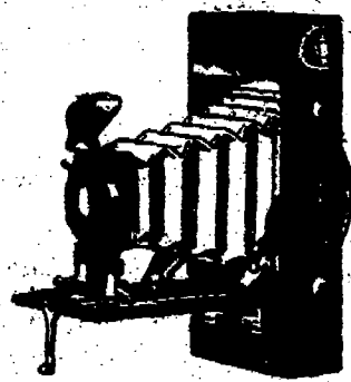
This is the new Autographic Brownie $6.00 and up.

We have just received a new supply of Autographic Kodaks, Brownie and Premos, N. C. and Autographic Films.