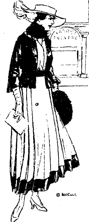
Costume of Velvet and Faille

The Popularity of the Jumper. Perhaps the most generally favored style of gown or blouse is the jumper; there is the little jumper bodice made with narrow shoulder straps, crossing suspended fashion down the back, or continuing down each side of the back in straight lines. The sleeveless basque in various styles is popular, too, with sleeves of satin, taffeta, or crepe Georgette. Many of the blue serge gowns, and the heavier fabrics, such as duvetyn and velours de laine, are made this way, as many dislike a heavy sleeve. This is also an economical idea, as the sleeves may be varied; a pair of satin or taffeta may do service for morning, and by substituting a guimpe of crepe Georgette, or chiffon cloth, the same frock becomes dressy enough for afternoon wear. A very chic dress of the new