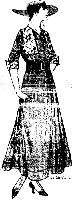
Checked and Plain Voile Combine in This Frock.

Simplicity is the mode in these waists, which button primly down the front and are sometimes tucked singly or in clusters.