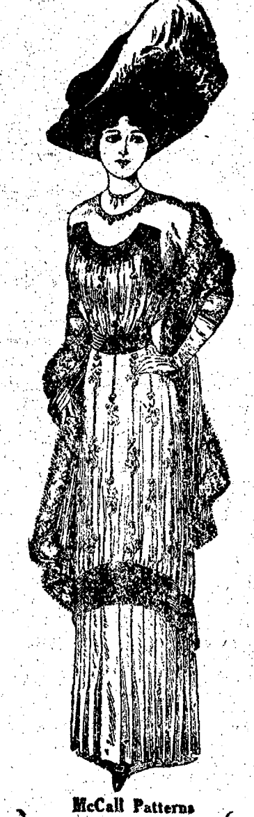
No. 3731-Waist. No. 3735-Skirt A BEAUTIFUL AFTERNOON GOWN

Just received a great line of Ladies coat suits We can please you if you have a want in this line. We have some very at-