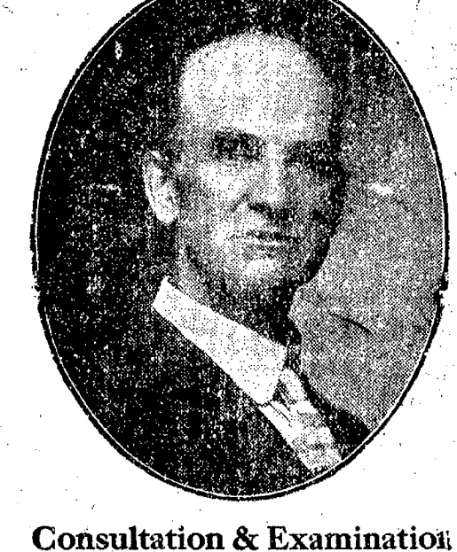
at all times FREE and Invited.

or correspondence solicited Read this carefully. If you are in good health, give it