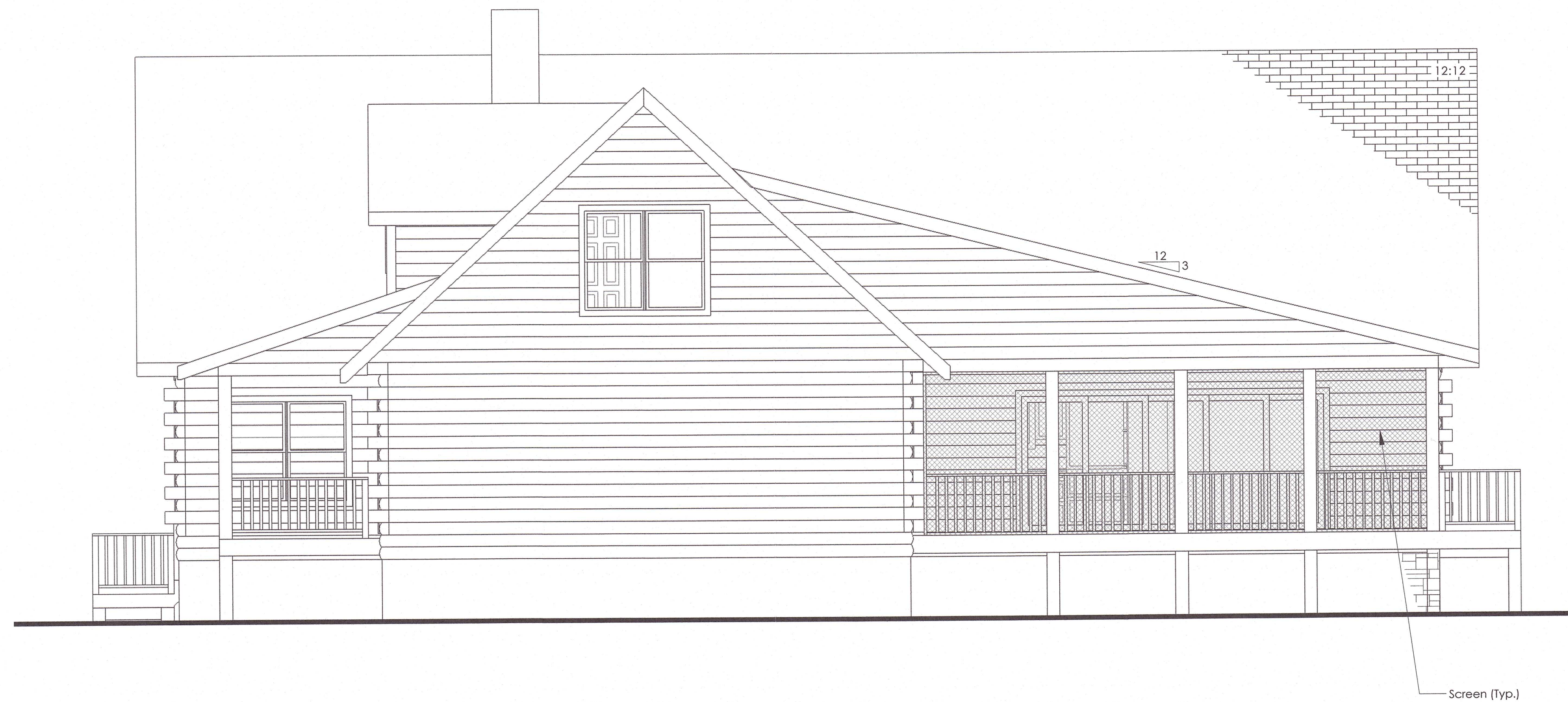
2/14 New Right Elevation SCALE: 1/4" = 1'-0"