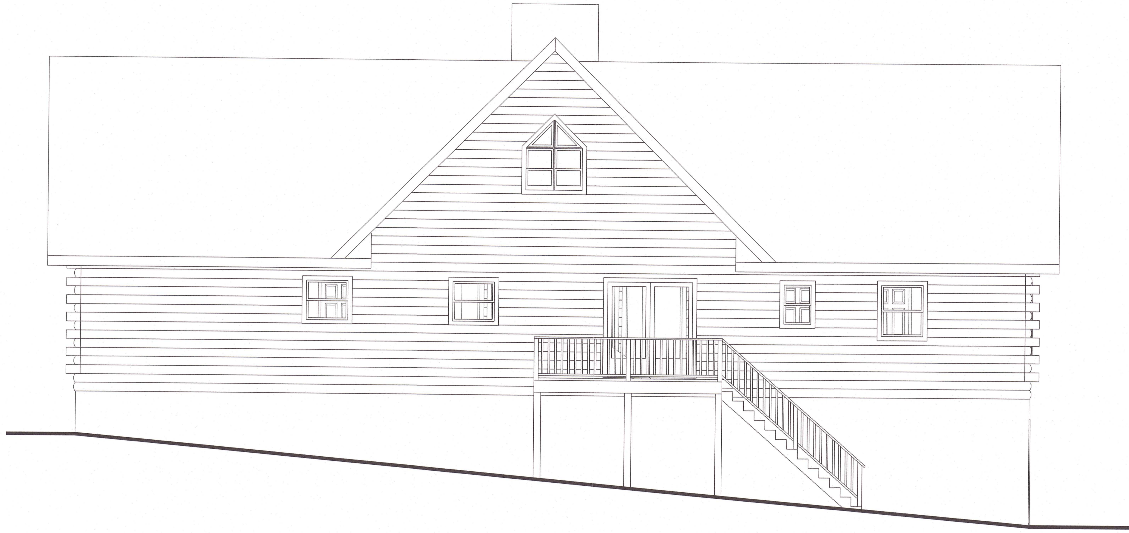
1/5 Existing Rear Elevation SCALE: 1/4" = 1'-0"