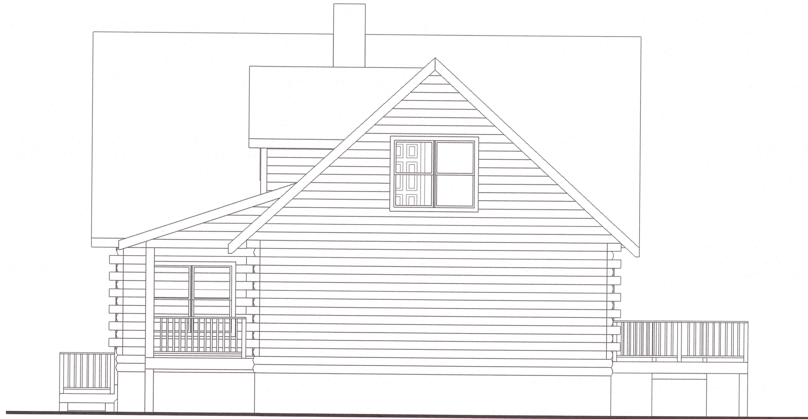
2/5 Existing Right Elevation SCALE: 1/4" = 1'-0"

Project Name The LaDelle Residence Addition