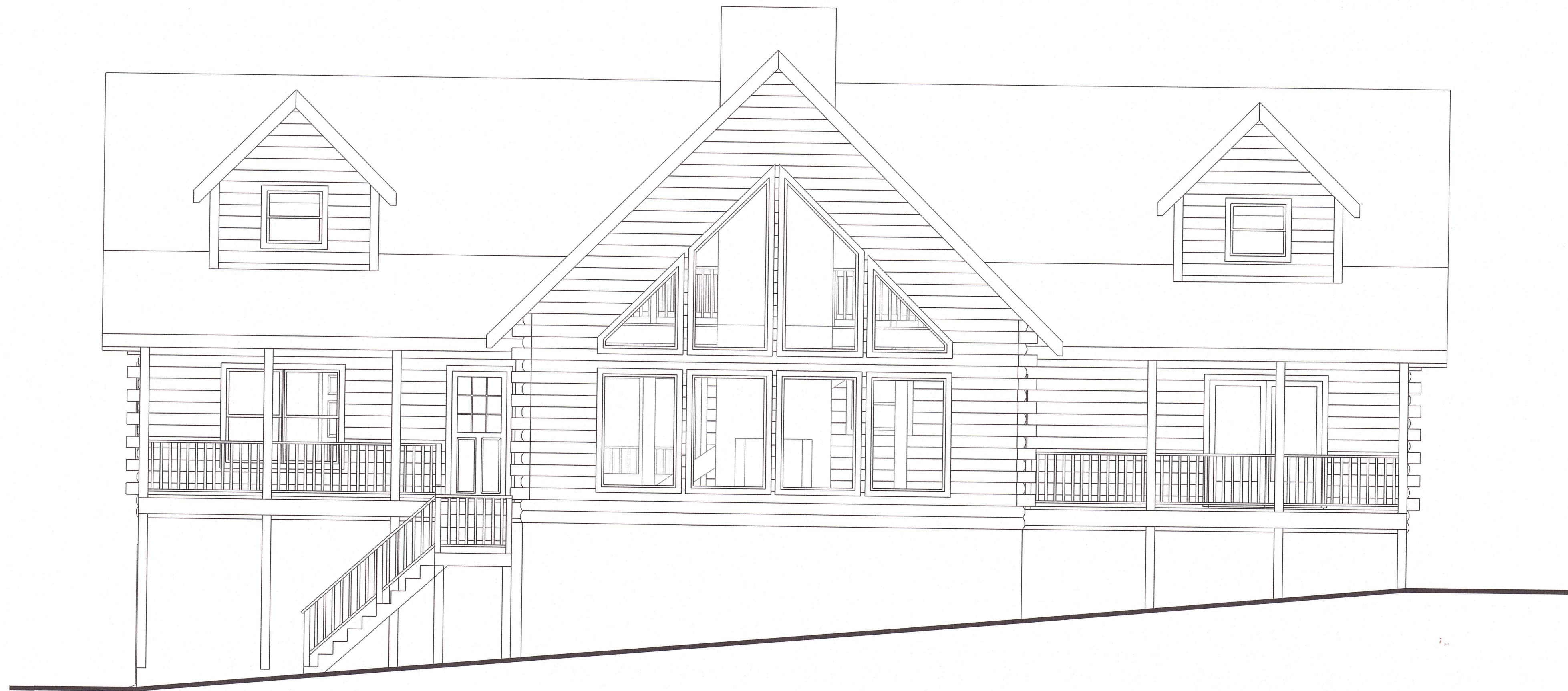
1/4 Existing Front Elevation SCALE: 1/4" = 1'-0"