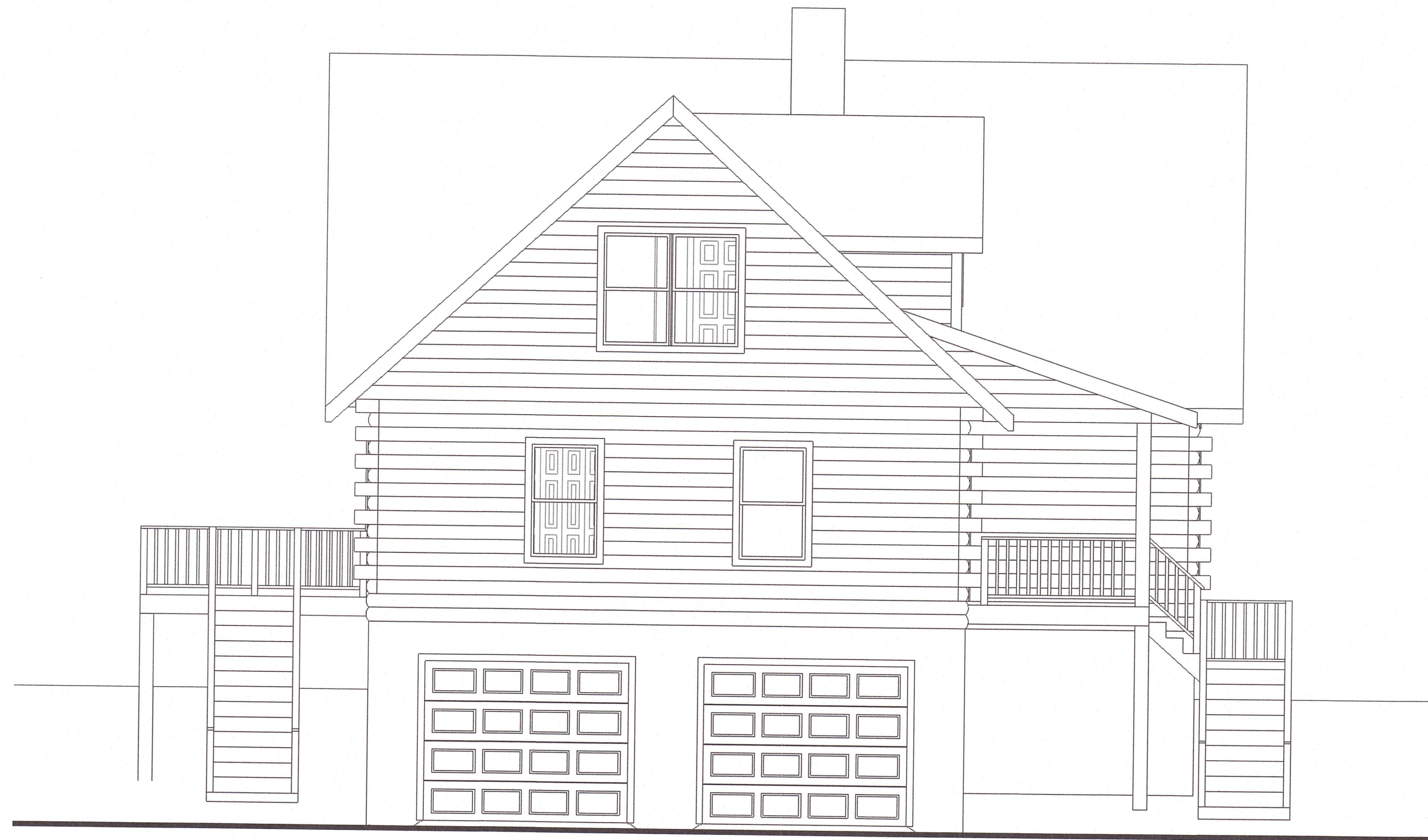
2/4 Existing Left Elevation SCALE: 1/4" = 1'-0"

Project Name The LaDelle Residence Addition